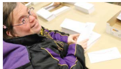
Last year stuffing the envelopes at the public library.

Being able to give back to the community in such a huge way while simultaneously living out our own mission of promoting social interaction in the community is a win-win! Our mission would not be possible without people like you!